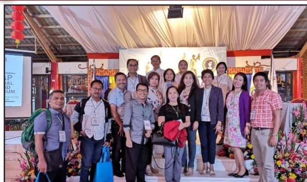
OOZING OPPORTUNITY. The faculty of Jose Rizal Memorial State University of Dipolog campus takes a pose with a great smile during the 16th AUAP International Forum held in Dakak Park and Beach Resort, Dapitan City.

The host President expressed her grateful gratitude to the AUAP officials for having this esteemed convergence in the Philippines particularly in Dapitan City as this was one of the best learning avenues to expand and to link more universities especially in the field of research.