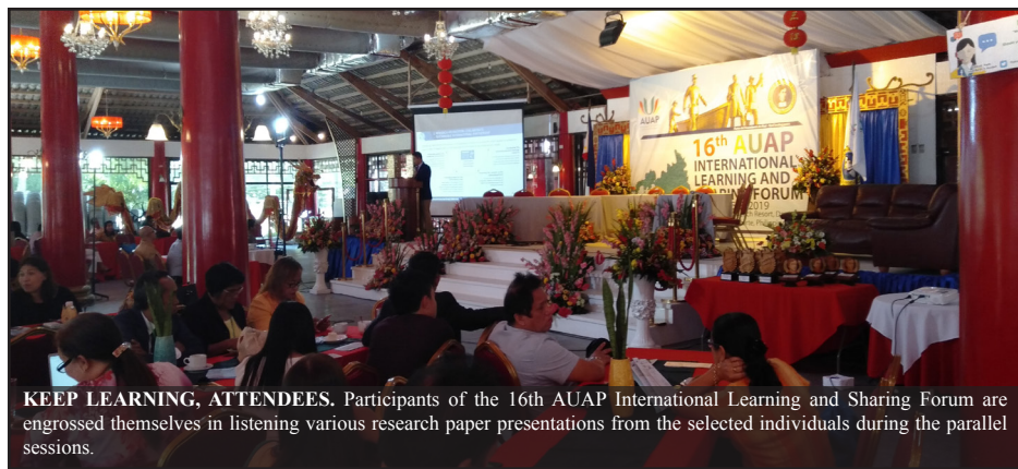
KEEP LEARNING, ATTENDEES. Participants of the 16th AUAP International Learning and Sharing Forum are engrossed themselves in listening various research paper presentations from the selected individuals during the parallel sessions.

During the gathering, the participants underwent several workshops on live and recorded reporting while others did documentary video about the different topics.