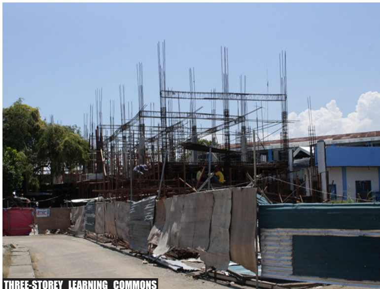
THREE-STOREY LEARNING COMMONS

The construction of the three-storey Learning Commons is expected to complete on the first week of January next year with a total budget of P17,126,205.49.