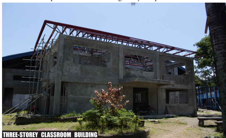
THREE-STOREY CLASSROOM BUILDING

With the presence of the two-constructed buildings, the university would make more students who are globally competitive.