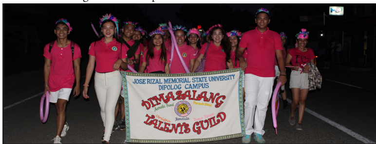
WALK FOR A CAUSE. The Dimasalang Talents Guild takes a resounding participation during the Alay Lakad-Takbo 2018.

The said event was sponsored by the city government of Dipolog city which was participated in by the various academic institutions, business sectors, local organizations, and other entities.